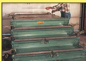
Reinforcing simply slides in where needed