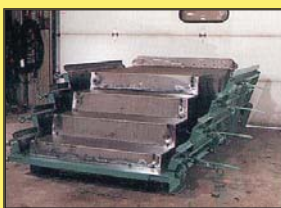
Break away outer walls make stripping easy

Attractive - Carefree - Economical - Quick - Permanent - Safe