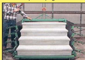
Open walls & attach lifting bar to remove