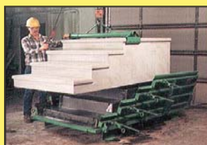
Lifts away smoothly & cleans up quickly

Single-Width Step Form From 1 to 8 Risers