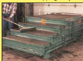
Give a broom finish as the concrete sets