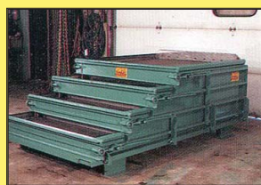
Clamp walls & trays down then pour upright